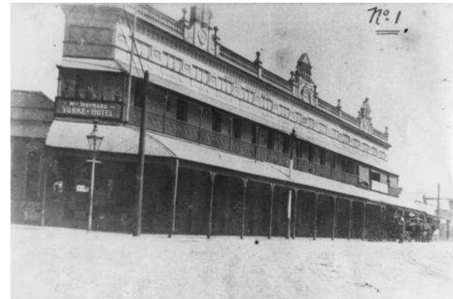
The grand frontage of the Yorke Hotel, seen from outside the Clarence Hotel, 1900s. The Yorke was originally known as the Stanley, and closed after WWII.

Cross the road at the lights, and either head down Annerley Road or take in some refreshment at the hotel. The other side of the street is dominated by the former Mater Children's Hospital.